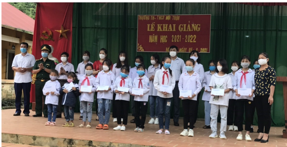
Two of the award ceremonies.