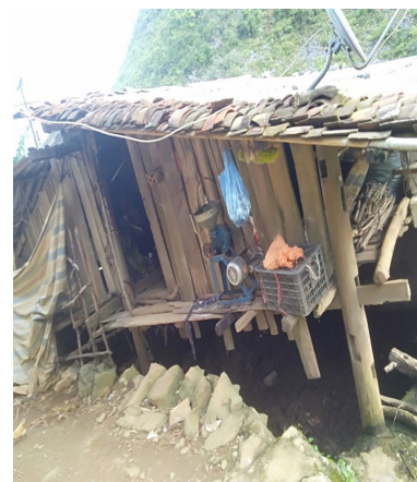
One student's house